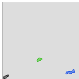
Assay 1 Lot: 62340205