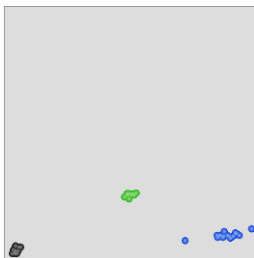
Assay 1 Lot: 80321209